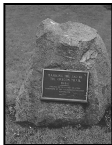
End of the “Oregon Trail” monument in Sylvester Park in downtown Olympia