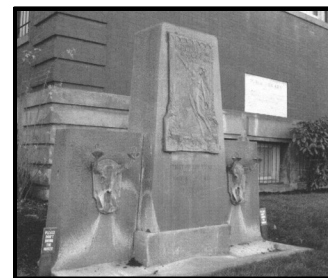
“Oregon Trail” monument at Clark County Historical Museum in Vancouver.

The “unique” marker at the north end of the Columbia