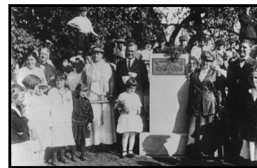
Dedication of Bush Prairie “Oregon Trail” marker near Old Hwy 99 and 88th Ave SW

Following in quick succession of the Tumwater dedication monuments were placed on Bush Prairie on September 10, 1916; Grand Mound