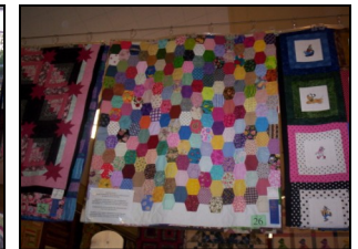
THA Quilter's Quilt on Display